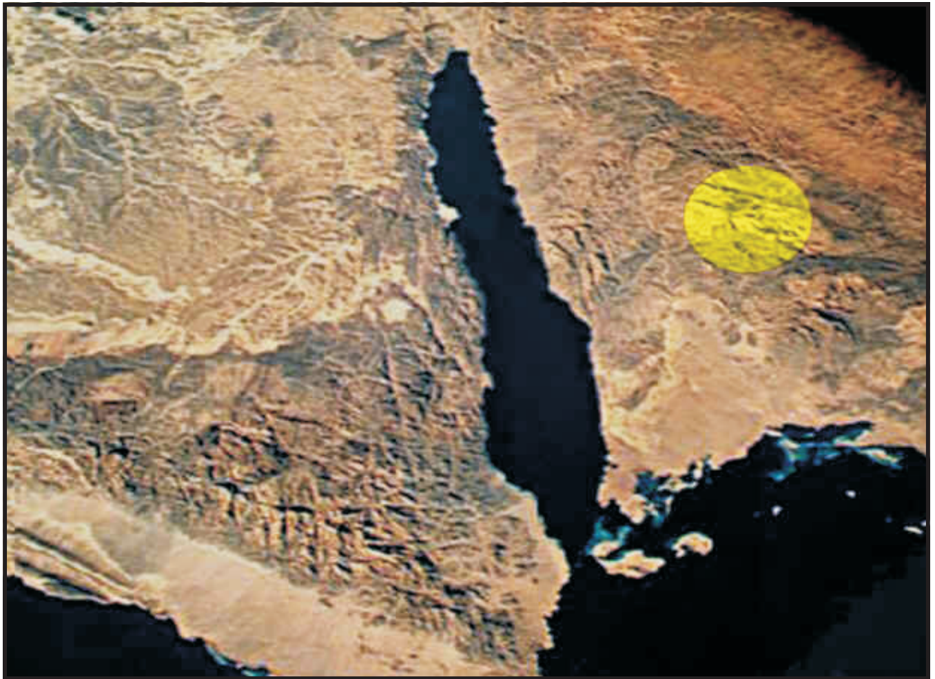
Mount Sinai in Midian -- Modern-Day Saudi Arabia

Day of Pentecost -- The Church in YEHOVAH's Master Plan