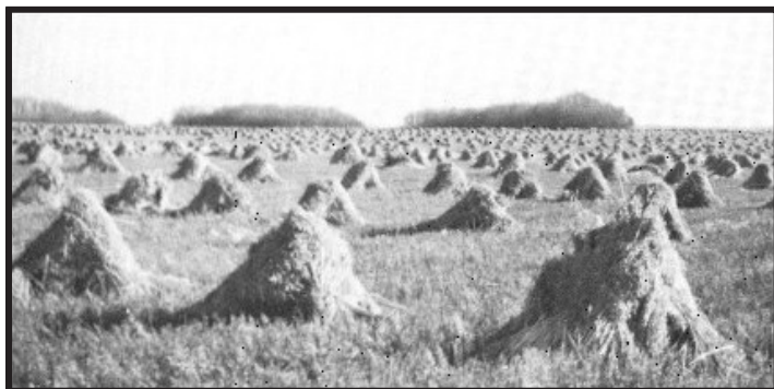
Harvest sheaves in a field. The spring barley harvest began with the symbolic wave-sheaf offering.

COMMENT: These Judeans were called “devout” men because although they were not yet disciples of the Messiah, they lived according to YEHOVAH’s laws revealed in the Old Testament. Remember, at this time the only Bible people had was what we call the Old Testament. The New Testament had not as yet been written.