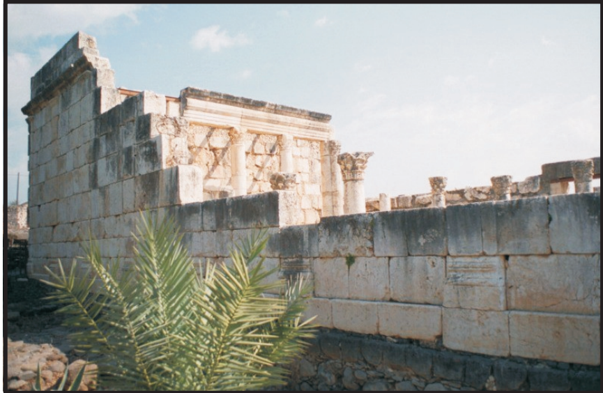
Synagogue in Capernaum sits on site of synagogue where the Messiah spoke. New Testament Christians always kept the Feast of Pentecost on either the 28th or 29th day of the 4th month of Tammuz.

2) If the THIRD MONTH (Sivan) contains 29 days , then the Feast of Weeks (Shavuot) falls on the 29th DAY of the FOURTH MONTH -- the