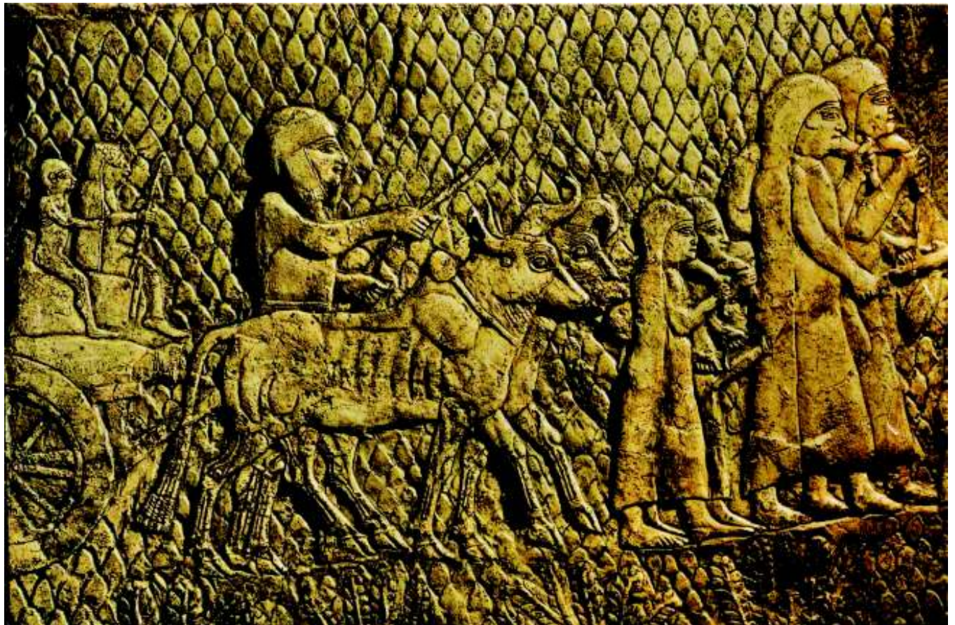
Judeans Being Deported to Assyria after the Defeat of Lachish