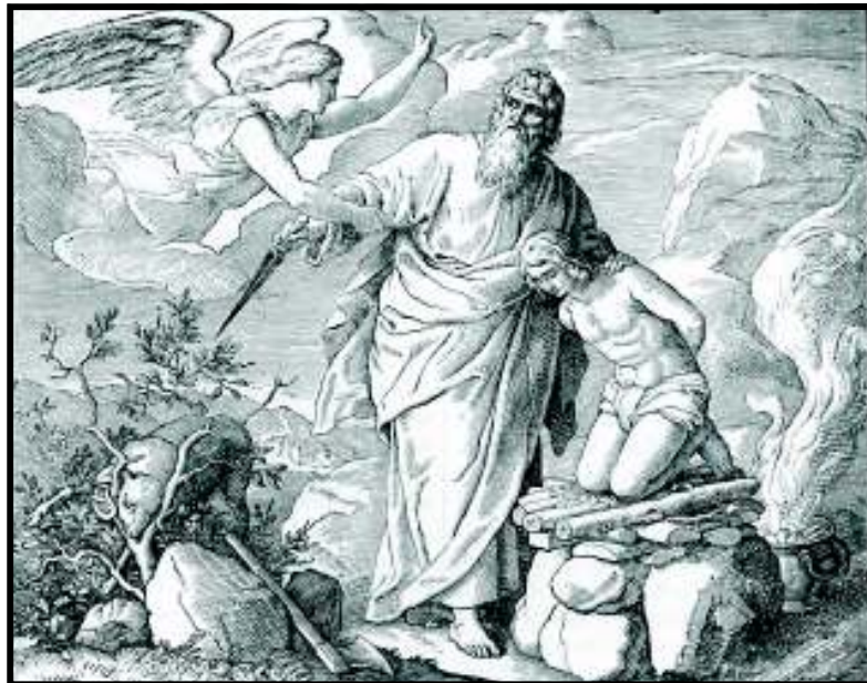
Abraham about to sacrifice Isaac. Genesis 22:11-13.

The singular term “ JEW ” is not used before this time! In reality, it does not appear until about a century or more after the use of the plural term. In fact, in Esther 2:5 , where we read: “Now in Shushan, the palace, there was a certain JEW whose name was Mordecai...a BENJAMITE .” Here the Hebrew of the term “ JEW ” again implies a JUDAHITE , this time from the tribe of Benjamin, which tribe, along with Judah, formed the Nation of the Jews (or the southern kingdom) after the Kingdom split into two parts, the northern kingdom being the Nation of Israel.