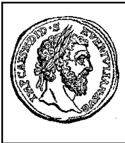
Above -- A coin of Emperor Julianus. To the Left -- Emperor Julianus. Some think he was emperor at the time of the Red Horse.

As is the case with the White Horse, there appears to be NO END to the GUESSES or "interpretations" available for this Red Horse. Notice this novel approach from the Internet --