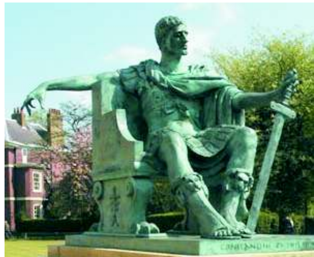
Bronze statue of Constantine in York Minster, England, near the spot where he was proclaimed emperor in 306 A.D.

granted to the rider ‘to take peace away from the earth,’ what could this mean but war, bloody war? So, then, when the Gentile Times ended in 1914 and the Rider on the white horse did ride forth, was this event marked by bloody war?