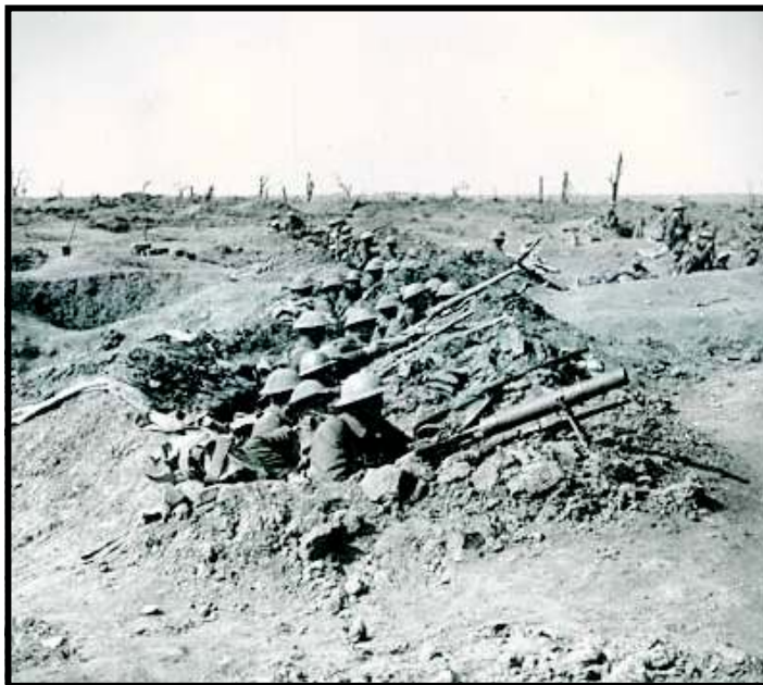
World War I infantry in reserve awaiting orders, 1916. Battle of Morval. Jehovah's Witnesses believe WWI to be the Red Horse of Revelation 6:4.

A Worldwide Church of God publication, entitled The Red Horse: War by George