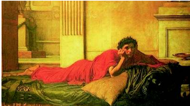
The remorse of Nero after killing his mother.

“The horse that John saw come forth was ‘fiery-colored,’ flame-colored, red like blood. Its color suggested blood! Very appropriately so, because it fitted in with the mission on which the horse’s rider rode, namely, ‘so that they should slaughter one another.’ Besides this, since it was